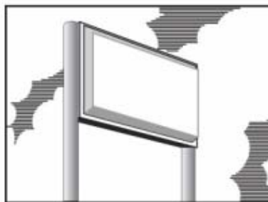
Double Face Between Pole Starting @ $560.00