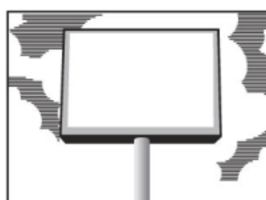
Double Face Center Pole Starting @ $690.00