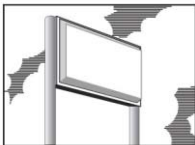
Double Face Between Pole Starting @ $570.00